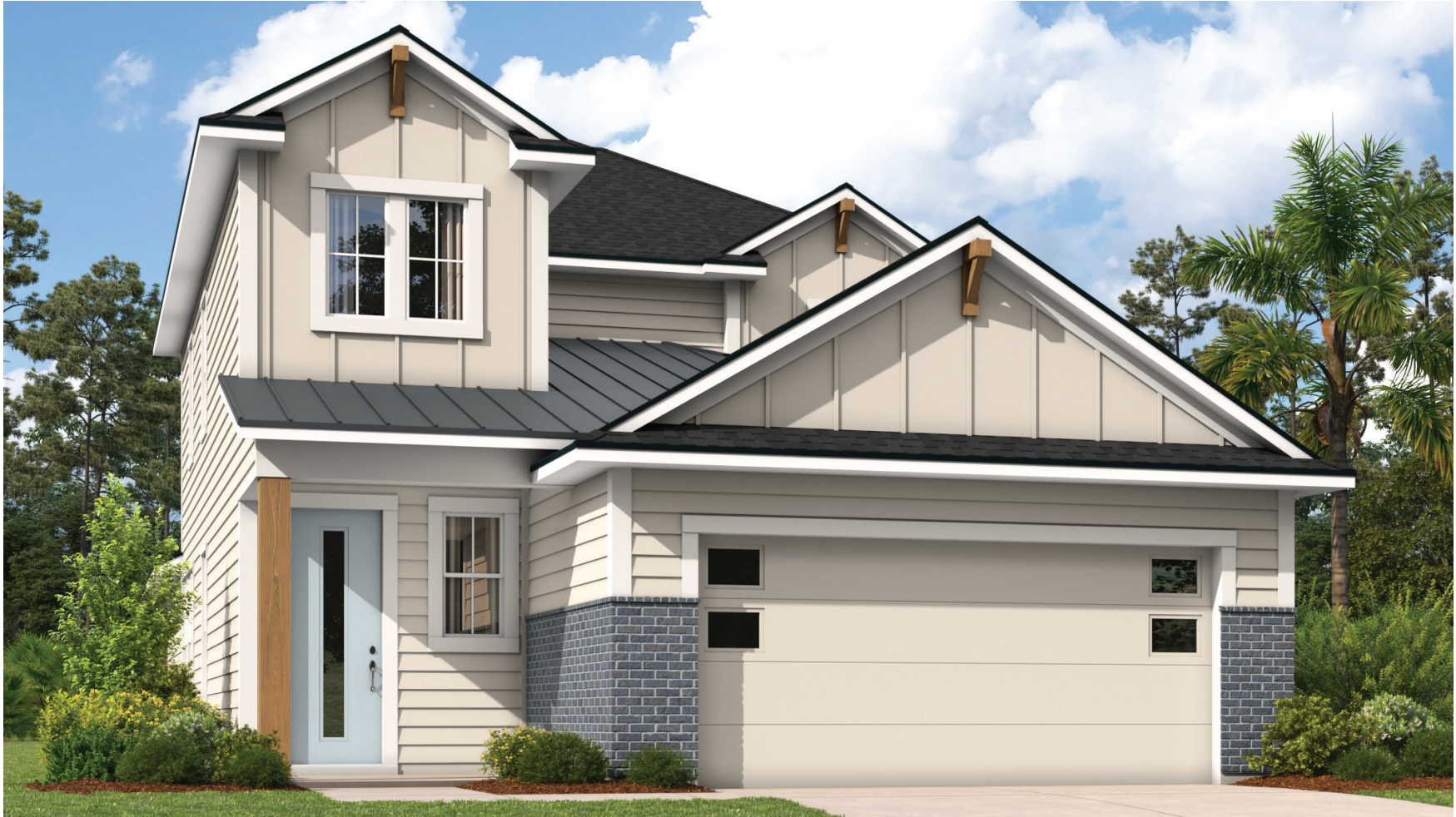
ELEMENTAL ELEVATION #2