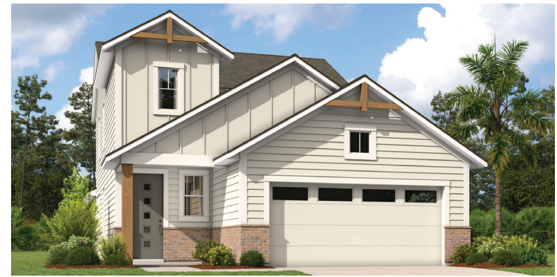
MODERN HERITAGE ELEVATION #5

4 BEDROOMS, 3 ½ BATHS, LOFT, FLEX, AND 2-CAR GARAGE LIVING AREA: 2,397 SQ. FT.