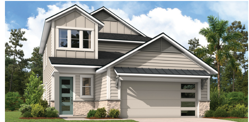
RUSTIC EDGE ELEVATION #3