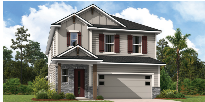
ELEMENTAL ELEVATION #1