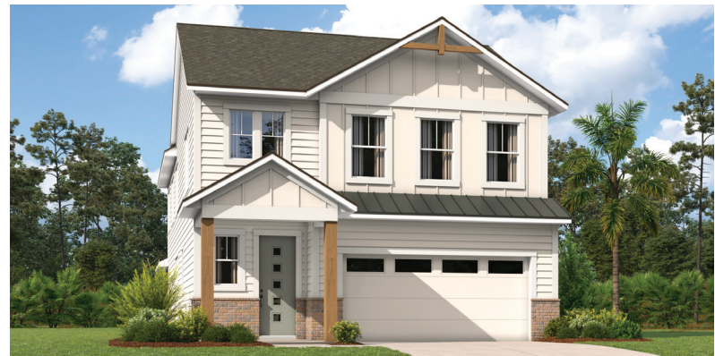
MODERN HERITAGE ELEVATION #1

4 BEDROOMS, 3 ½ BATHS, LOFT, AND 2-CAR GARAGE LIVING AREA: 2,400 SQ. FT.