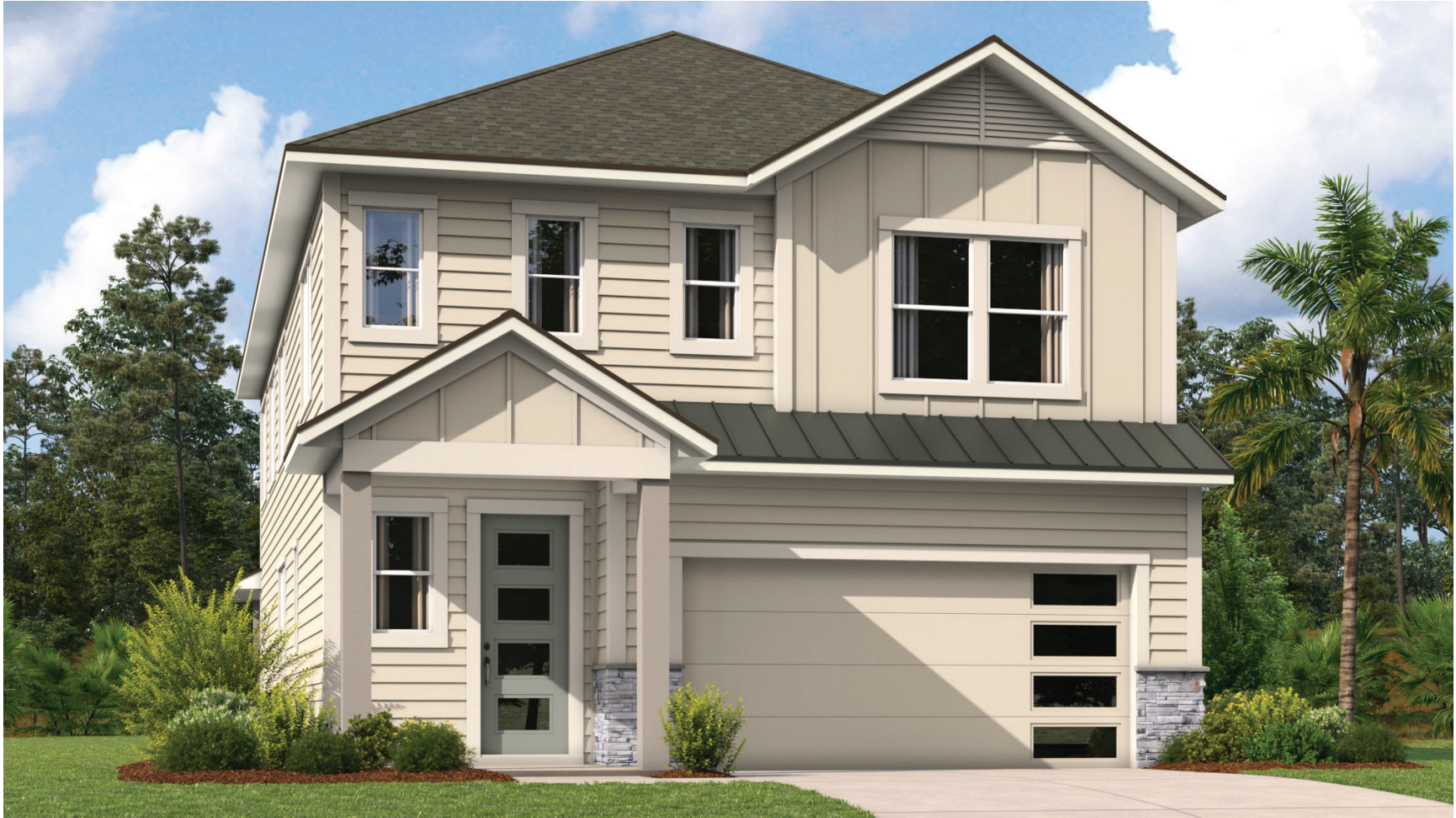
RUSTIC EDGE ELEVATION #4