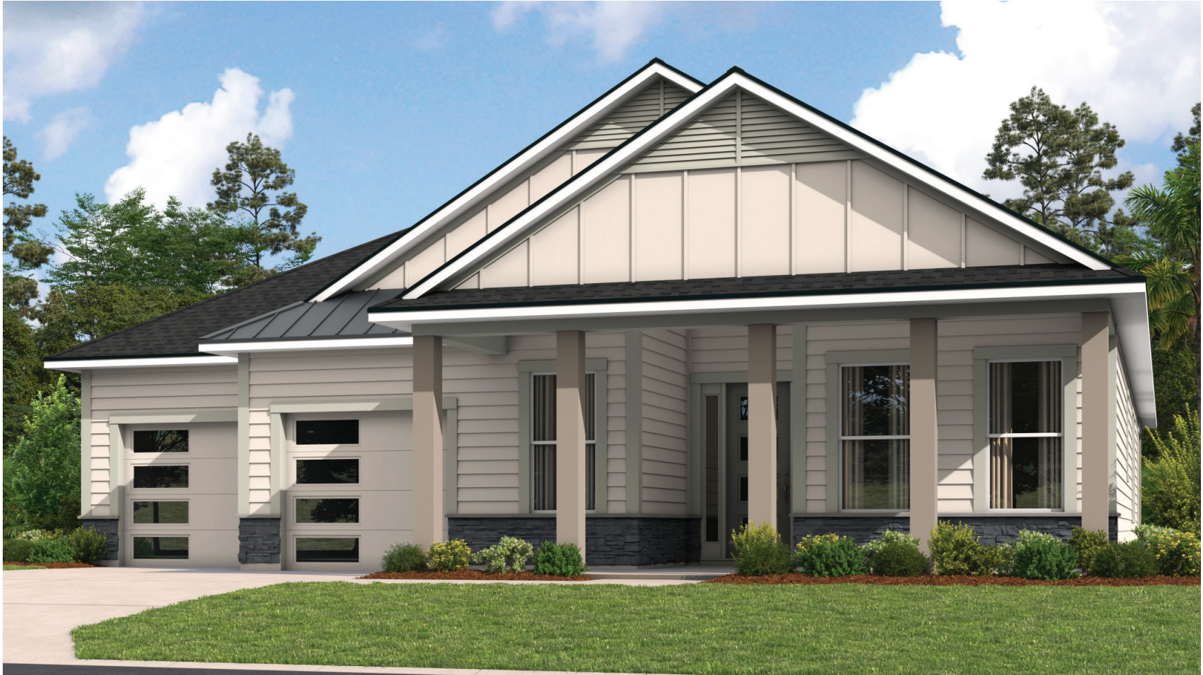
RUSTIC EDGE ELEVATION #3