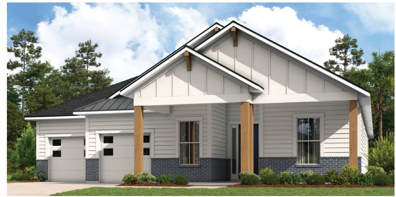
ELEMENTAL ELEVATION #1

4 BEDROOMS, 3 BATHS, STUDY, AND 3-CAR TANDEM GARAGE LIVING AREA: 2,806 SQ. FT.