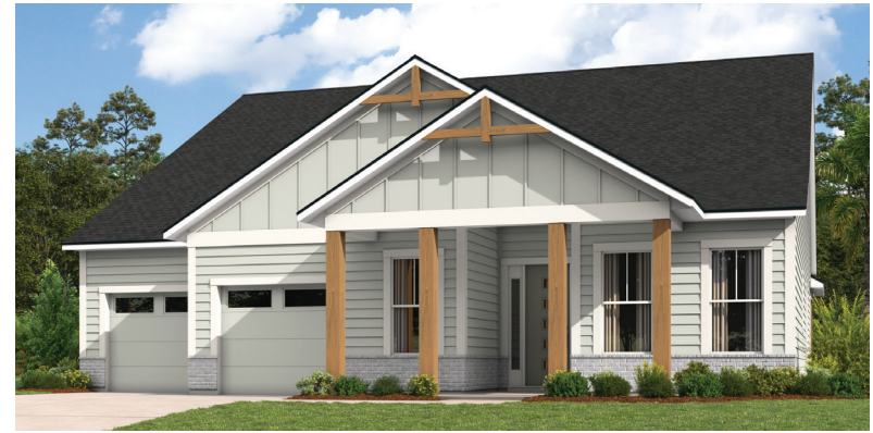
MODERN HERITAGE ELEVATION #6