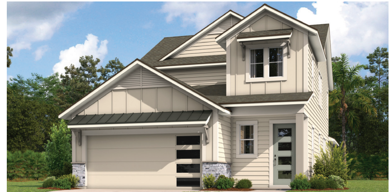
RUSTIC EDGE ELEVATION #1