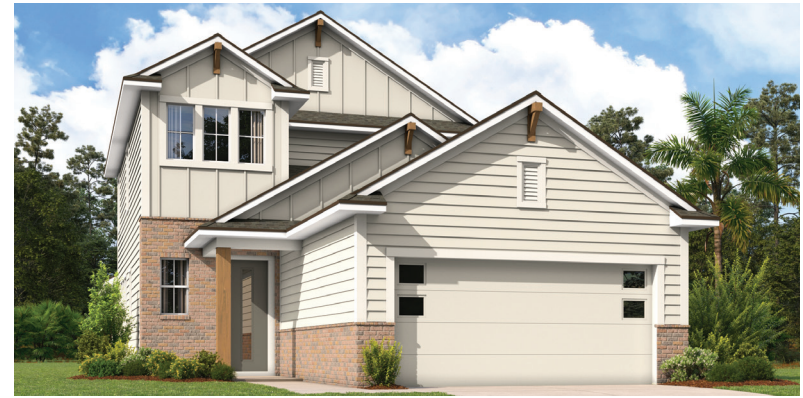
ELEMENTAL ELEVATION #6

4 BEDROOMS, 3 ½ BATHS, LOFT, AND 2-CAR GARAGE LIVING AREA: 2,392 SQ. FT.