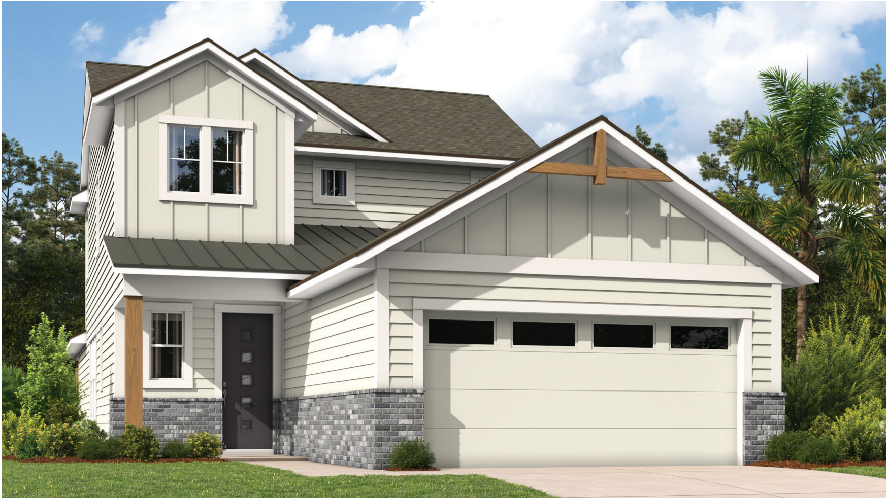
MODERN HERITAGE ELEVATION #3