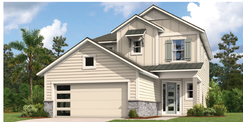
RUSTIC EDGE ELEVATION #1

3 BEDROOMS, 2 ½ BATHS, LOFT, STUDY, AND 2-CAR GARAGE LIVING AREA: 2,276 SQ. FT.