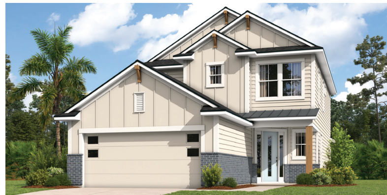
ELEMENTAL ELEVATION #5