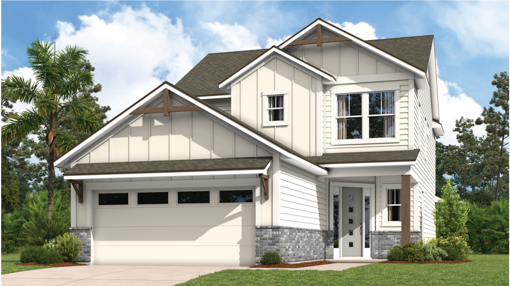
MODERN HERITAGE ELEVATION #4