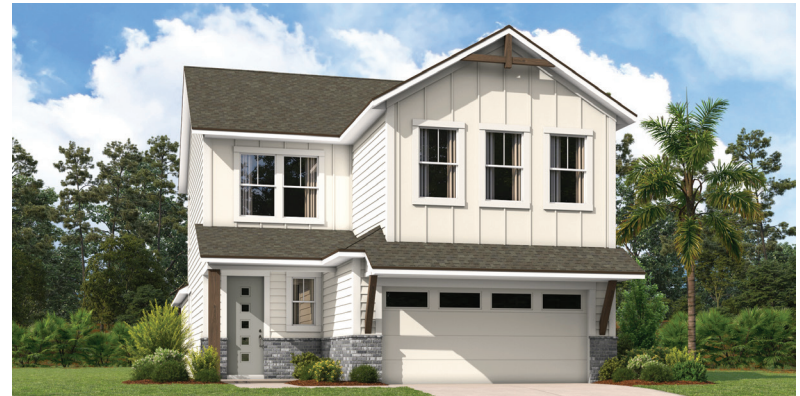
MODERN HERITAGE ELEVATION #6