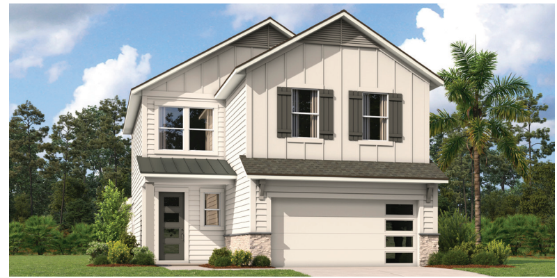
RUSTIC EDGE ELEVATION #3

4 BEDROOMS, 2 ½ BATHS, LOFT, AND 2-CAR GARAGE LIVING AREA: 2,398 SQ. FT.