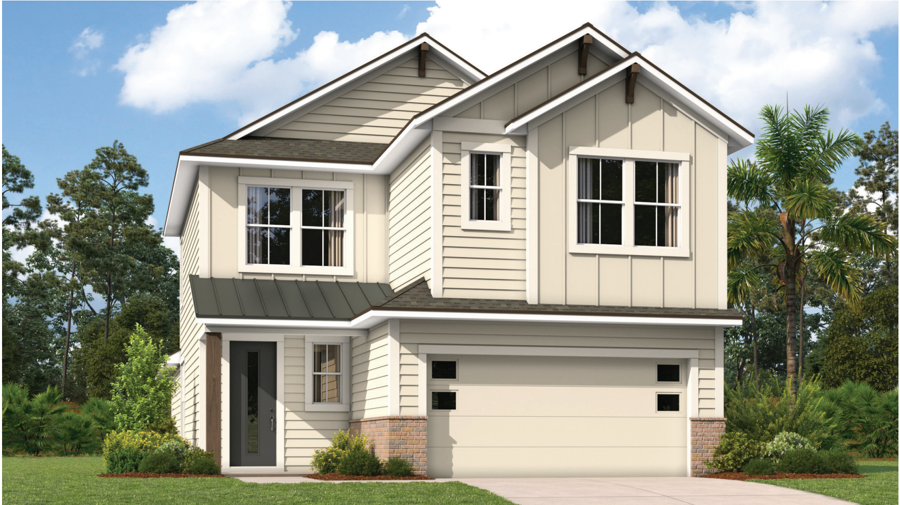
ELEMENTAL ELEVATION #5