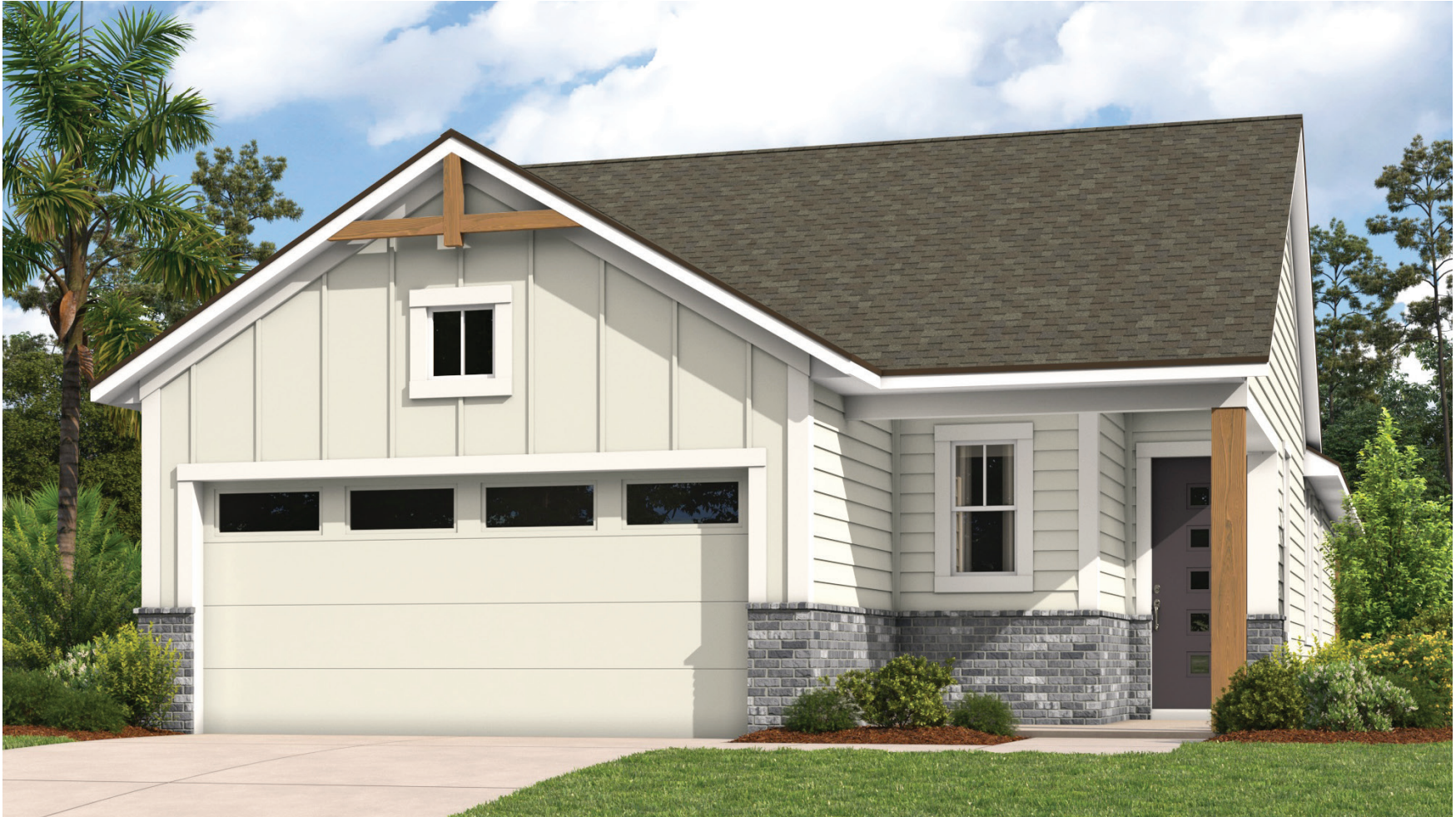
MODERN HERITAGE ELEVATION #5