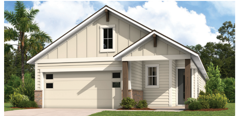
ELEMENTAL ELEVATION #6