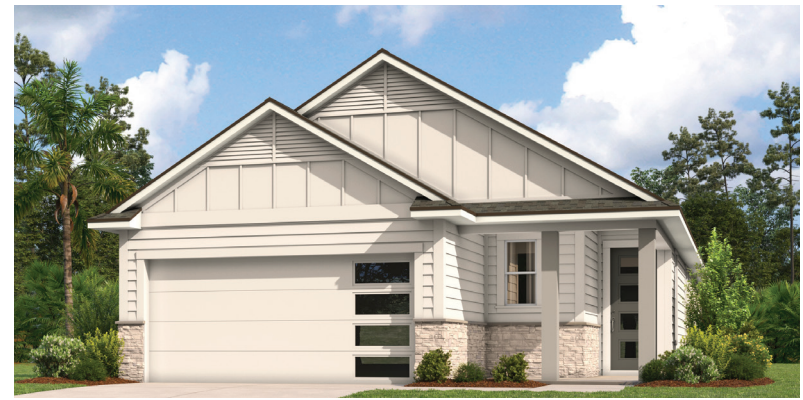
RUSTIC EDGE ELEVATION #6

3 BEDROOMS, 2 BATHS, AND 2-CAR GARAGE LIVING AREA: 1,593 SQ. FT.